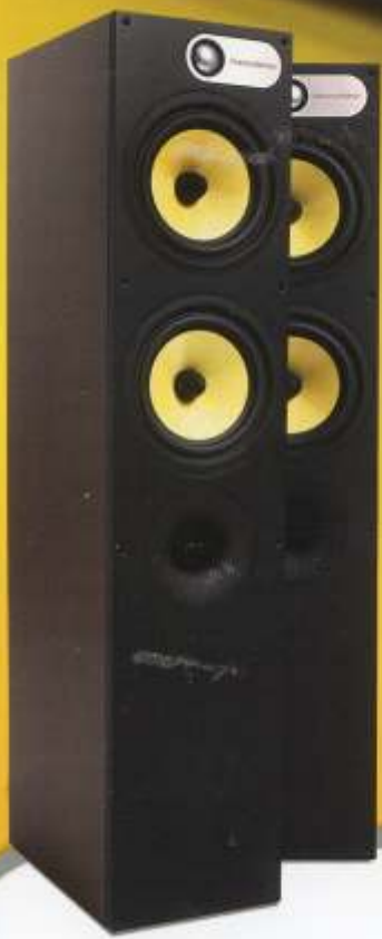
B&W 684 Star of the 600 Series