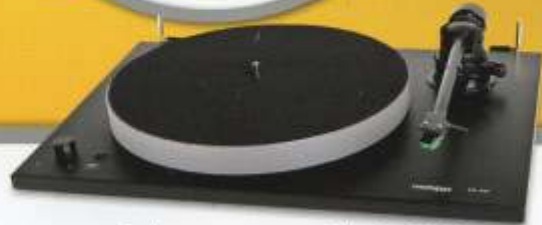
Thorens TD700 Plug 'n' play classic